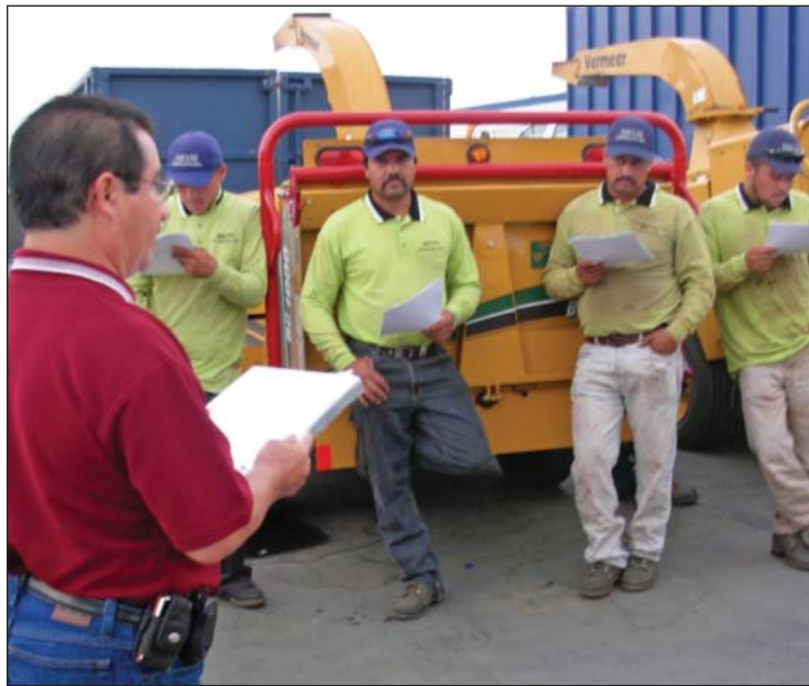
Under the workers' compensation rating rules, the Landscape Gardening Class is not allowable for tree care ground workers.

The workers compensation worker classification system involves a lengthy and comprehensive series of detailed industry descriptions that all insurers who offer workers' compensation insurance use when determining which categories an insured company's workers will be assigned to and which rates they will charge for them. These "rules" can vary to some degree from state to state, so what may apply to a tree care company in one state may not apply in another state. If a company has operations in multiple states,